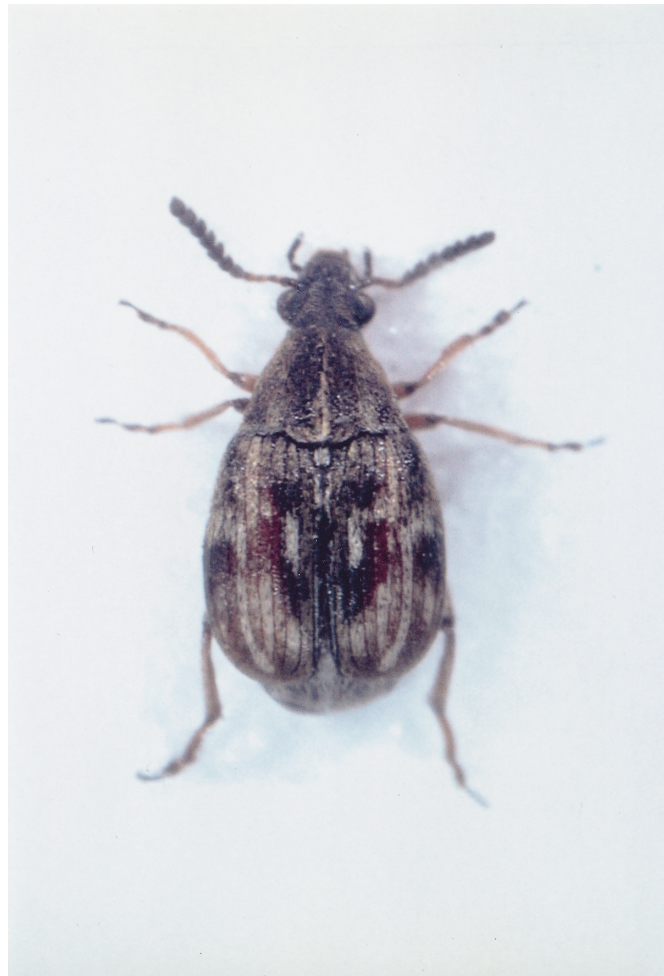
Fig. 1. Acanthoscelides pallidipennis (Motschulsky).

Body size: 1.1–2.1 mm from pronotum to elytra.